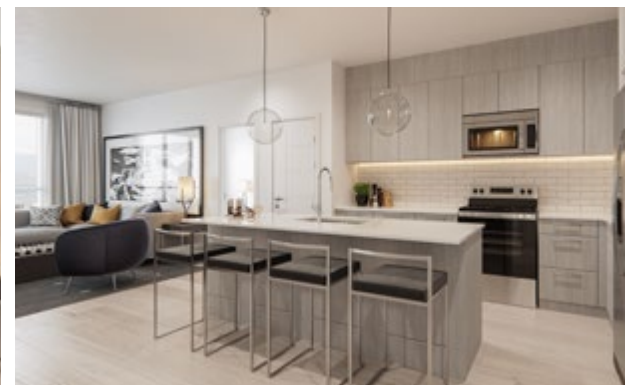
N.Y. Colour Selection _____