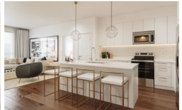
L.A. Colour Selection _____